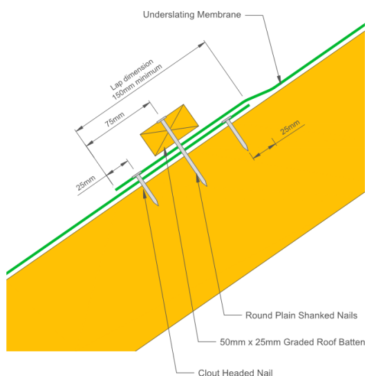
Figure 2: Creating the Overlap - Battened Overlap Detail

When being used unsupported, the roofing membrane should achieve a nominal 10mm drape in between the support positions in order to prevent contact with the underside of the tiles, thus avoiding the transfer of wind loading to the primary roof covering. The drape also serves as drainage for water within the batten space to the eaves position and into the gutter. Fully supported membranes i.e. installed over sarking boards must incorporate counter battens.